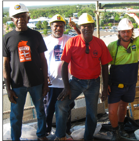
photo: Gurindji workers and unions campaign on a construction site in Darwin

Jobs with Justice for all communities No to compulsory Income Management Aboriginal control of Aboriginal affairs